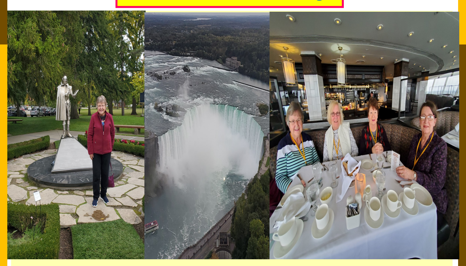
ILR's Niagara-on-the-Lake and Stratford, Ontario Trip October 28, 2022