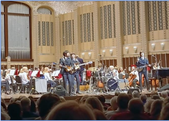
(Above) Cleveland Pops Orchestra: A Tribute to the Beatles, Feb. 3