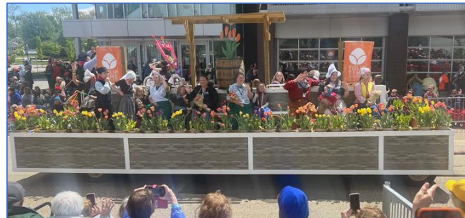
(Left and above) Holland, Michigan Tulip Time, May 9 - 11