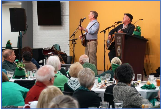
(Above and below) New Barylecorn performance and guests at ILR Spring Luncheon, March 6