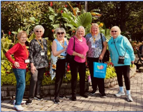
ILR travel experiences this autumn included a Canadian Theater Adventure (above) and Bourbon Trail Louisville (right).